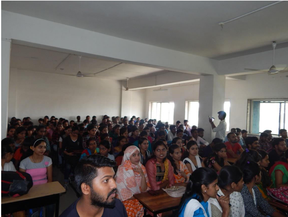
Students Presents in the Inauguration of science association